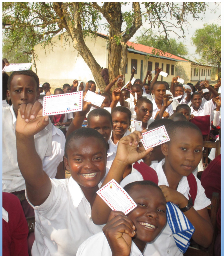
UCE Outreach Tanzania August 2016