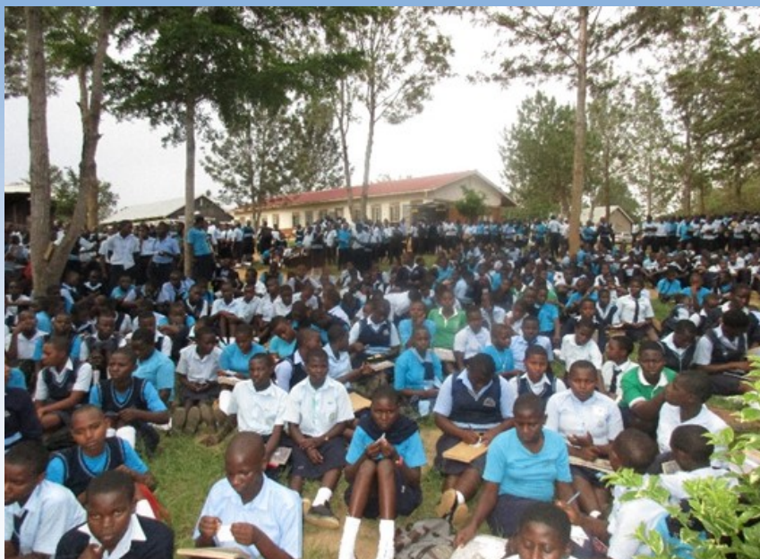
UCE Outreach April 2017 UGANDA