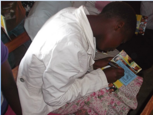
Student signing UCE chastity card after outreach