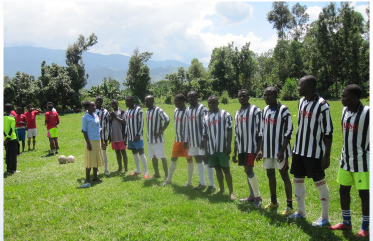
UCE Club soccer match (above)