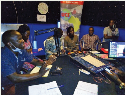
The UCE team giving an outreach on the radio

UCE teams took to the radio waves, which was a new endeavor for them. "These radio talks are so good because they have helped us spread the UCE message." Due to country-wide closures due to Covid-19, UCE-Masaka was required to curtail its' outreaches to the schools. Radio broadcasts allowed them to share the message with the students while adding parents and other members of the community. During one broadcast, a caller who heard the message for the first time, requested that the team visit his home and promised that he would mobilize his neighbors to hear the "Godly UCE message".