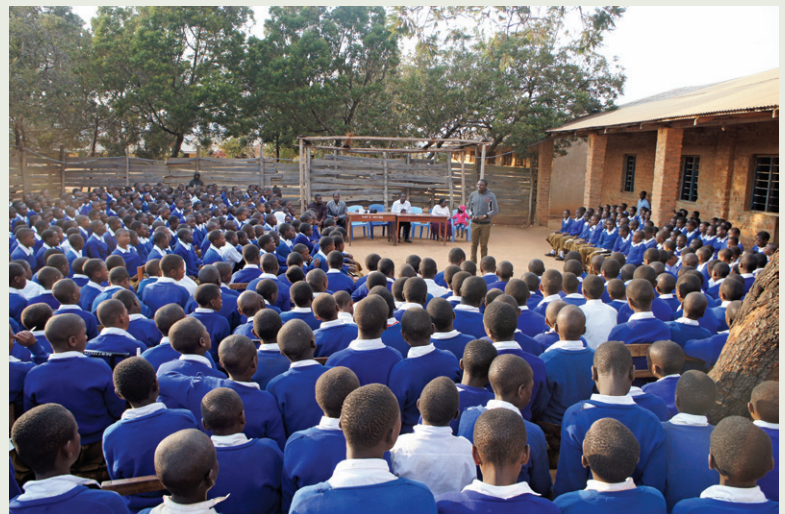
Students listening attentively to a UCE-Tanzania outreach