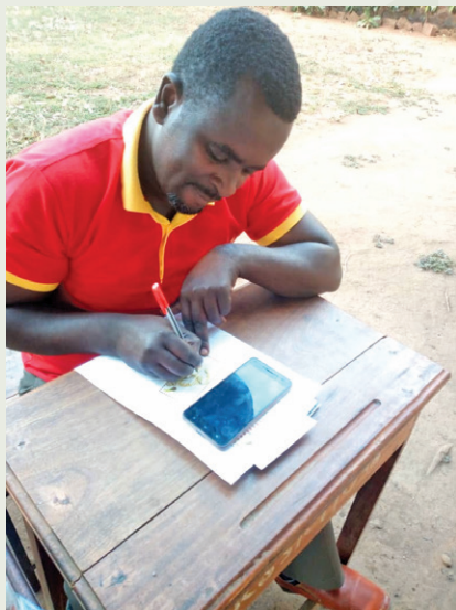
Teacher committing to chastity

The UCE team reported an awesome moment when the teachers themselves gave powerful witness to the students: “At the end of the outreach at Kolero Secondary School, the UCE team asked which students were ready to sign chastity cards but it was very surprising that all four married teachers requested to sign faithfulness cards to renew their commitment to marriage ”. After the outreach, the principal thanked the UCE team for the chastity message and announced, “It is God’s grace to have this kind of education and it is officially from now on that our school has a UCE Club.”