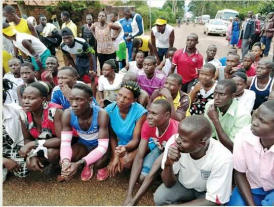
UCE "Chastity Day" footrace participants

Prior to the onset of closure of the country by Covid-19, the team was met by hundreds of students at the secondary schools. In December, at a "Chastity Day" celebration at Kitovu, students participated in a cross-country foot race and bicycle race. While they competed, a friendly netball match took place between the female youth leaders and the