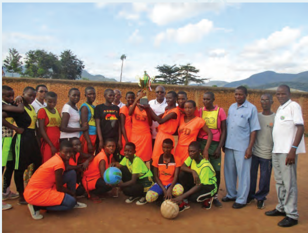
Amahoro Secondary School UCE Club girls netball team wins national cup victory.