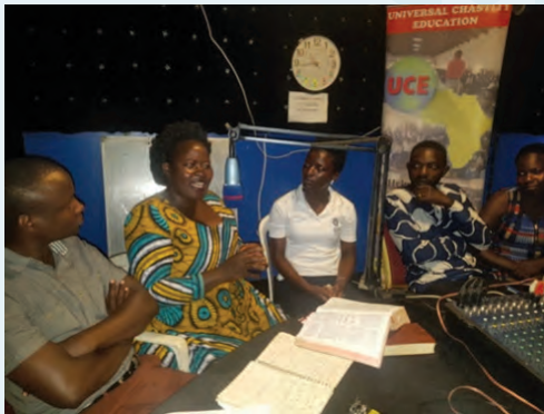
The UCE team inspires and brings hope to those facing difficult situations.

microphone, "Many times students have goals and fight hard to make it but haters pull them down and make them lose focus. To those that are feeling down, God pulls them up and gives a second chance. Some students may feel empty but God says, "Surrender all your burdens and I will relieve you and bless you." (Ps 55 :22, 1 Peter 5 :7, Mat 11 :28-30, Is 41 :10)