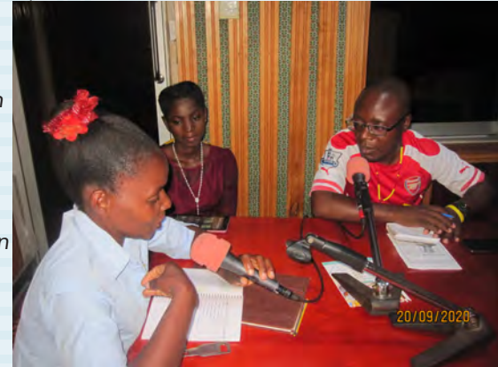
UCE-Uganda Kasese weekly radio outreaches during two Covid-19 lockdowns.

The UCE radio ministry has broadcast weekly for many years, so when Uganda closed down schools and churches for lengthy periods twice during Covid-19, the radio show continued on strong with team testimonies and a call-in Q/A session. The listeners living in this remote rural area where "spare parts" are a necessity to survive, fully understand the most important part of the UCE message: "Life has no spare!" The UCE team leader continues, "Look at yourself as a precious creature because indeed you are. Guard yourself jealously. Most men and women are taken up by bodily lust-- not love. Don't submit to lust, for you will regret the unbearable outcomes. Let's keep our bodies holy, patiently asking God for the right, true, loving, God-fearing husband/wife who can embrace Holy Matrimony and become faithful to each other thereafter. Let us live holy lives for the glory of God for our bodies are temples of God." (Ps 139:14 and 1 Cor 6:16)