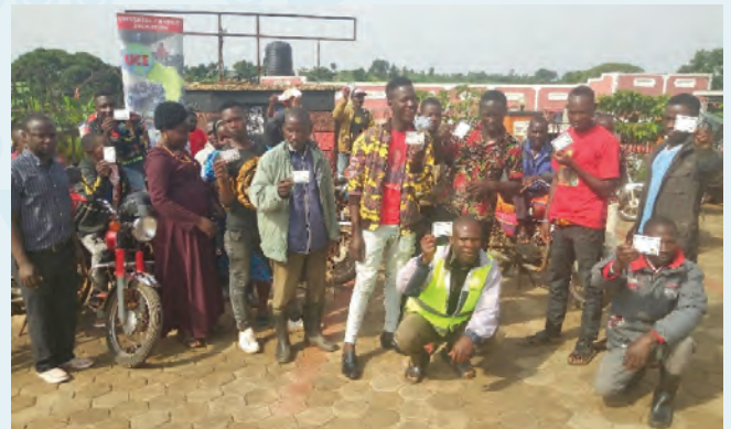
Masaka, Uganda “Boda-boda” drivers commit to chastity, March 2021.

Transportation “Boda-boda” drivers take people around the community for small fees on their motorized bikes, but they are notorious for their promiscuity. UCE-Masaka brought their message of second chances, abstinence, and faithfulness in marriage to this group.