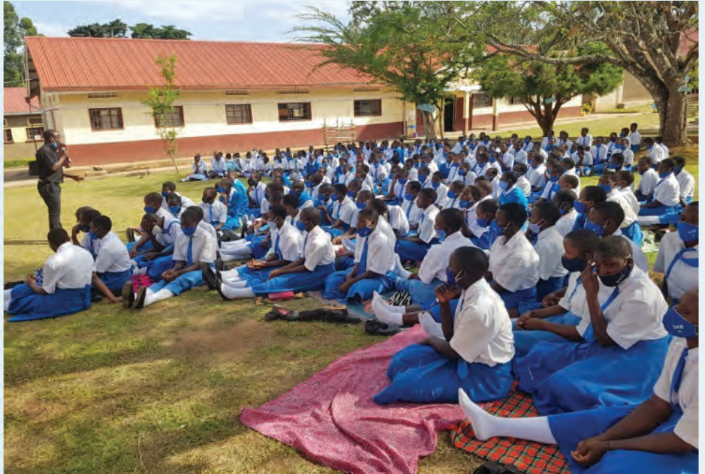
Girls learn the “A-B-C’s” of A bstinence until B eing faithful in marriage, through C hrist.