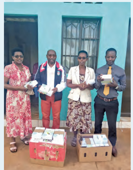
UCE-Burundi unpacks newly printed UCE Manuals, Kirundi translation.

The UCE-Burundi team celebrated the translation and printing 500 copies of the UCE Manual into their native Kirundi language. The UCE Manual answers hundreds of questions about sexuality that youth ask at an outreach.