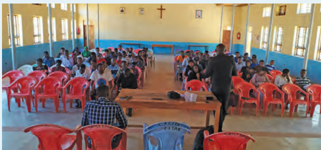
UCE-Tanzania team speaks to law students at Iringa University.

Future attorneys heard the full UCE message and 190 first-year law students pledged to chastity, after which one student proclaimed, “I will make sure other youth will get to hear about chastity. I feel very sorry for all who have missed this opportunity, and I beg you to arrange another seminar for other classes. God bless you.”