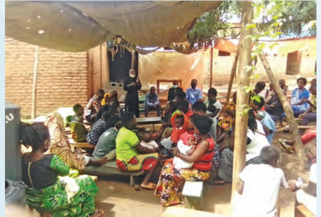
UCE-Kasese outreach to Kanyazi, Uganda couples

Married Couples sent pleas for help from UCE teams to strengthen marriages. Problems of unfaithfulness, polygamy, HIV/AIDS, men not providing basic needs for their families, child abuse, impending divorce, and children dropping out of school, prompted their willingness to hear a new message of “second chances” through faithfulness and chastity. In Burundi there were four such sessions given to groups of 20-30 couples. In Tanzania, UCE was invited by the Kigamboni Women’s Group Association to share with them and their children. In Uganda, the Mother’s and Father’s Unions of Kanyazi church and the married couples from Katembu were visited by the UCE-Kasese team with multiple couples signing fidelity cards.