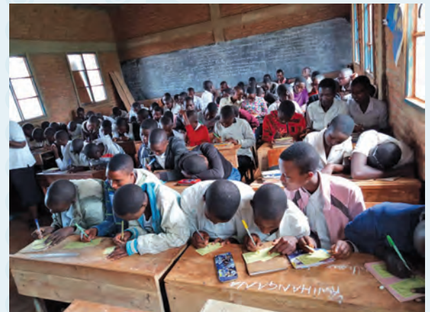
Youth signing chastity cards during Gasamari school outreach.

chaos, but from that time, I haven't seen any pregnancy in this school. My students were totally transformed."