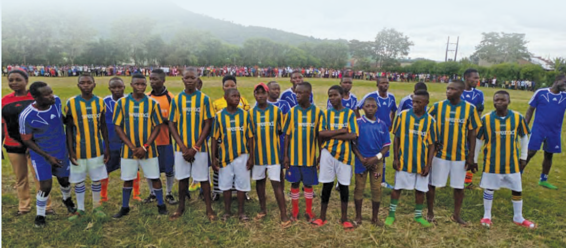
UCE-Kasese Clubs sports matches began again when schools reopened in May 2021.

A UCE-Kasese 2011 team "pioneer" returned home from the University to tell the students how making the commitment to abstinence strengthened her to succeed.