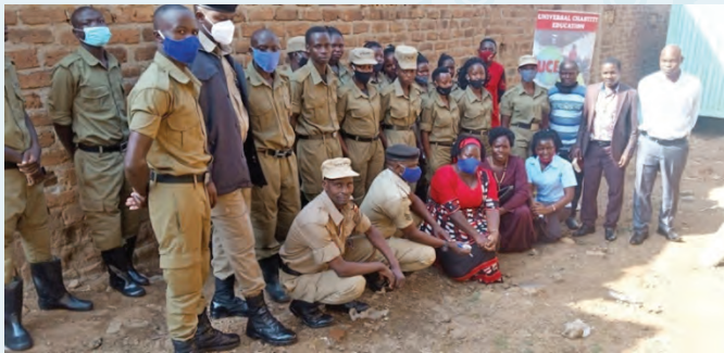
Masaka, Uganda police gather after their UCE session.